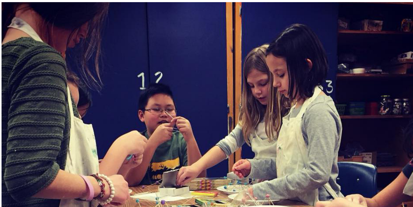
The after-school art program at Van Devender Middle School gives first through fifth grade students in Wood County Schools an opportunity to learn and experience the visual arts.