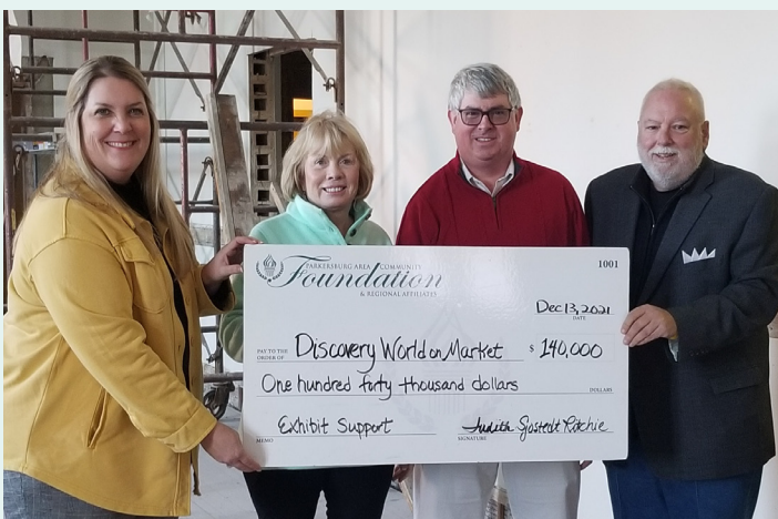
Six funds of the PACF came together to support exhibit development and construction at the DWM in 2021. Together, the funds awarded $140,000 in funding!

DWM opened its doors to the public on April 2nd. To learn more about DWM call 681-588-5800 or visit www.dwonmarket.org .